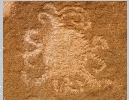
There are many petroglyphs at Chaco Canyon. This is an example from Chaco Culture National Historical Park.

At Chaco Canyon in New Mexico, a petroglyph carved into the rockface by early Pueblo people may represent an eclipse that occurred there on July 11, 1097. The petroglyph has a swirling loop jetting off the side – perhaps representing a coronal mass ejection from the Sun. NASA studies coronal mass ejections now using spacecraft that mimic the view seen from Earth during eclipses. There are many petroglyphs at Chaco Canyon, which provide important clues about how Ancestral Puebloans studied the Sun. The many Indigenous groups in North America have a variety of interpretations of eclipses, developed throughout history.